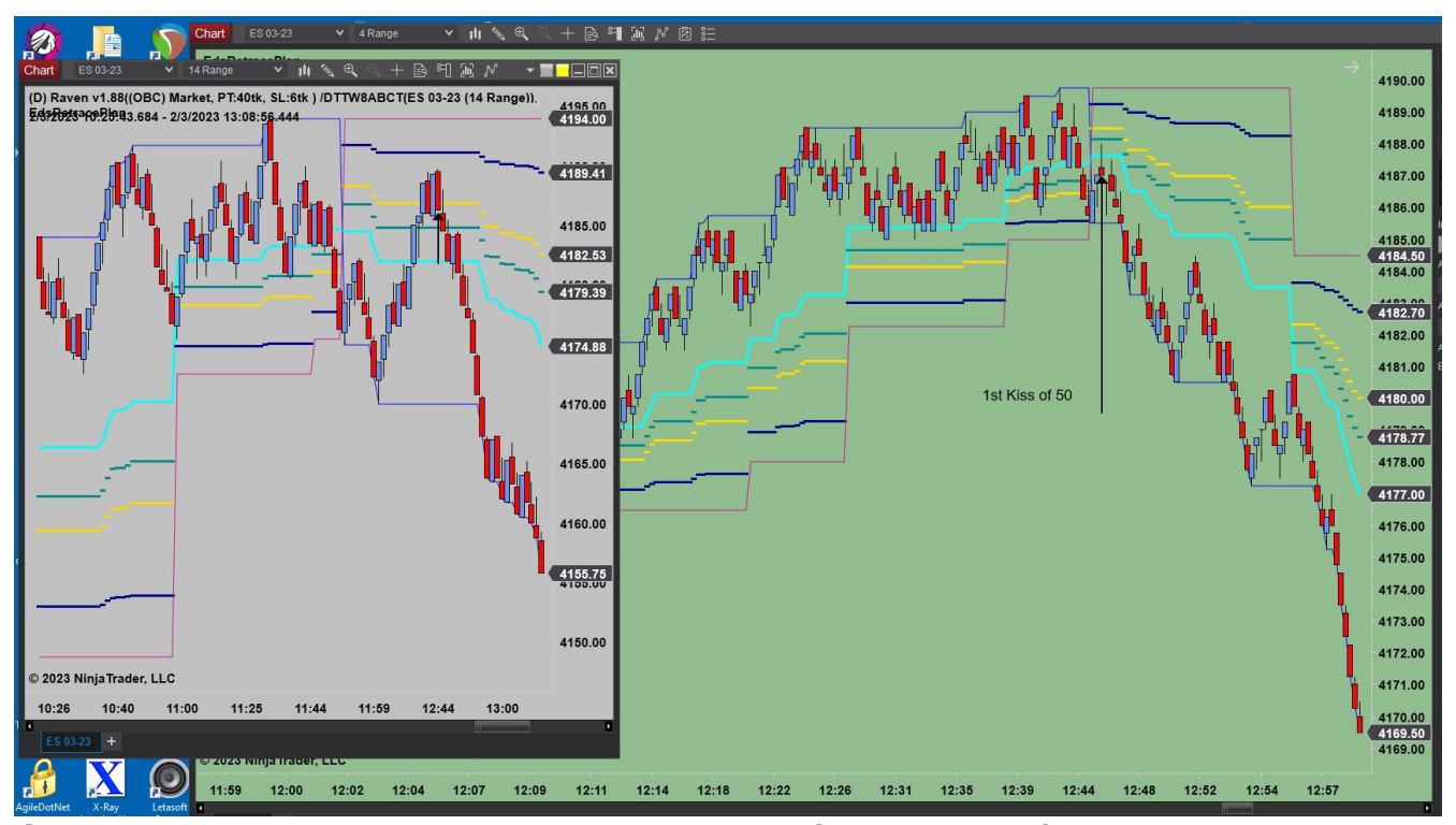
See how the 14 Flipped short almost a full hour before the 4 range. See it? And a 1<sup>st</sup> 50 Kiss on the 4 very quick?